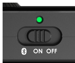
FIRMWARE UPDATE SUCCESSFUL (SOLID)