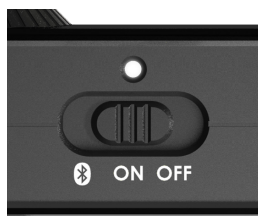
FIRMWARE UPDATE INITIATED (SOLID) IN PROCESS (FLASHING)

When a firmware update is complete, the POWER SWITCH LED will illuminate solid green to indicate a successful update; the LED will illuminate solid red to indicate a failed update. Mustang Micro is automatically powered up during the firmware update process; when an update is completed successfully, disconnect the USB cable from Mustang Micro and restart the unit.