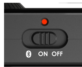
FIRMWARE UPDATE FAILED (SOLID)