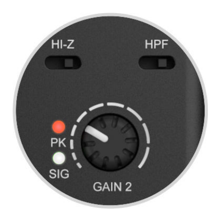
Channel switches and the GAIN knob

All switches are active when the lever is moved to the right. The levers are recessed to prevent accidental adjustment. Use a thin, sharp object, such as a paperclip, toothpick or a pen tip to slide the lever to the right to activate the feature.