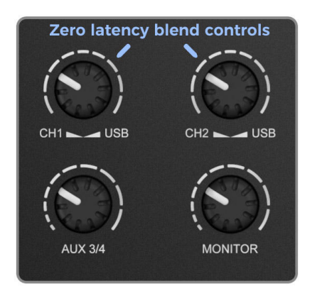
Blend, Aux3/4 and MONITOR controls

Blend controls adjust the mix between the zero latency input signal and USB playback. This allows you to strike a balance between the inputs on Ch 1 or 2 (CCW) and the stereo signal coming back from your computer or smartphone (CW), as seen below: