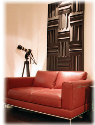
Hi Fi room - Sweden