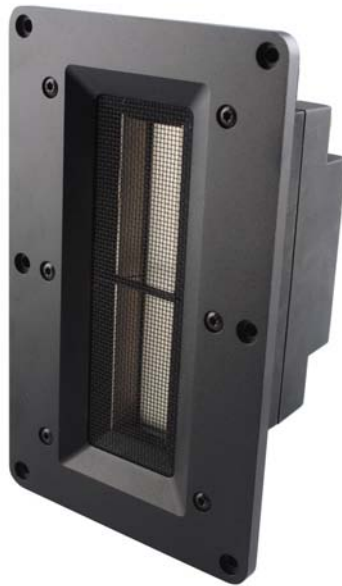
NeoPro5i True Ribbon Tweeter